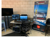
BaseLight @ Culver City