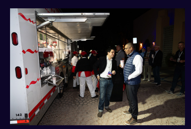
EVENING NETWORKING Enjoy food trucks, fire pit socializing, and nightly cocktail hours.