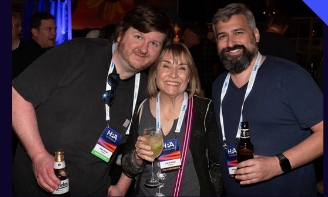
VIP LOUNGE For select member levels and sponsors.