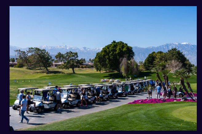
SUNDAY WELCOME ACTIVITIES Join golf, pickleball, or yoga to break the ice.

Unparalleled networking with a captive audience!