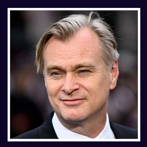
Christopher Nolan Filmmaker (Oppenheimer, Interstellar, Inception, The Dark Knight)