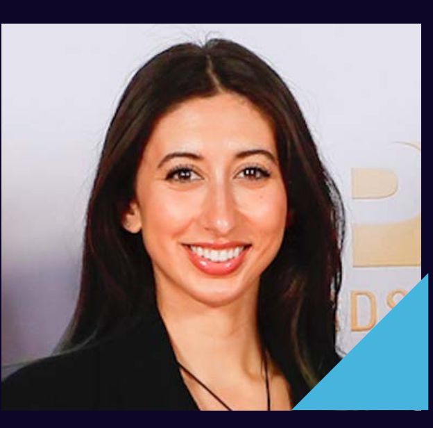
MEMBERSHIP ENGAGEMENT SPECIALIST