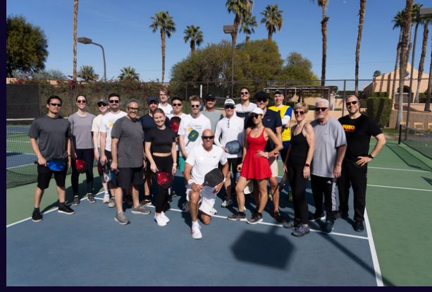
SUNDAY WELCOME ACTIVITIES Join golf, pickleball, or yoga to break the ice.