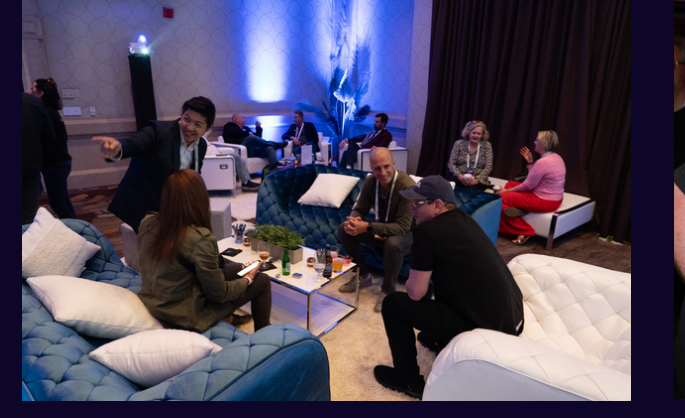
VIP LOUNGE For select member levels and sponsors.