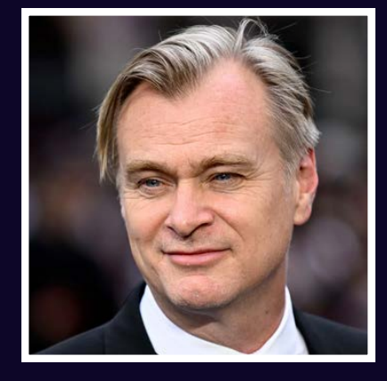
Christopher Nolan Filmmaker (Oppenheimer, Interstellar, Inception, The Dark Knight)