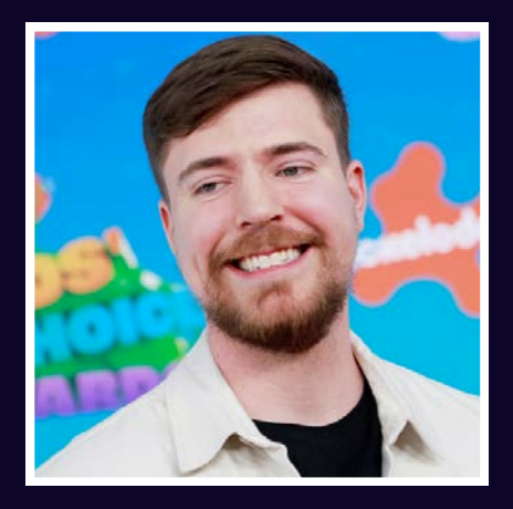
MrBeast YouTuber and media personality (375 million subscribers)