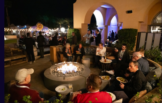
EVENING NETWORKING Enjoy food trucks, fire pit socializing, and nightly cocktail hours.